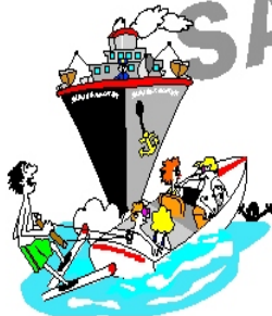
ON THE WATER